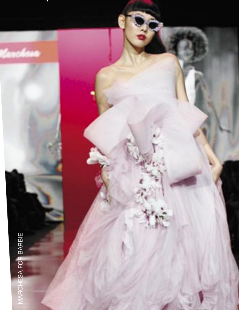
MARCHESA FOR BARBIE