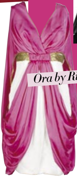
Ora by Rimalya