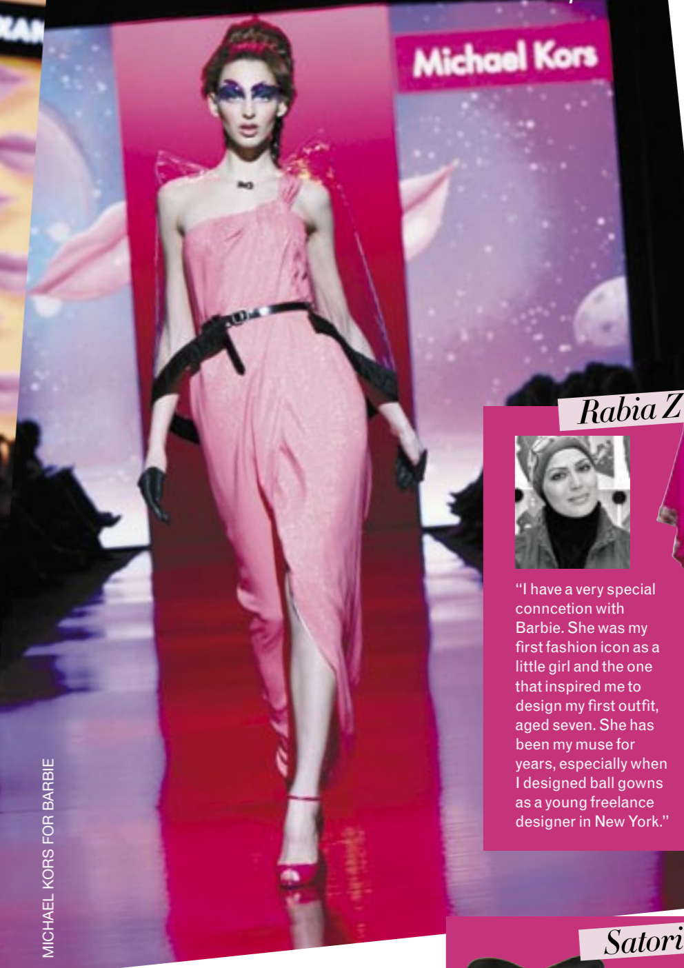
MICHAEL KORS FOR BARBIE